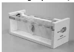
FlexiMag Separator Jr.

(B) The SPHERO™ FlexiMag Separator Jr. (Cat. No. FMJ-1000) is designed for small scale use. It holds up to eight 1.5 mL microfuge tubes, 5 mL cryovials, 10x75 mm or 12x75mm tubes.